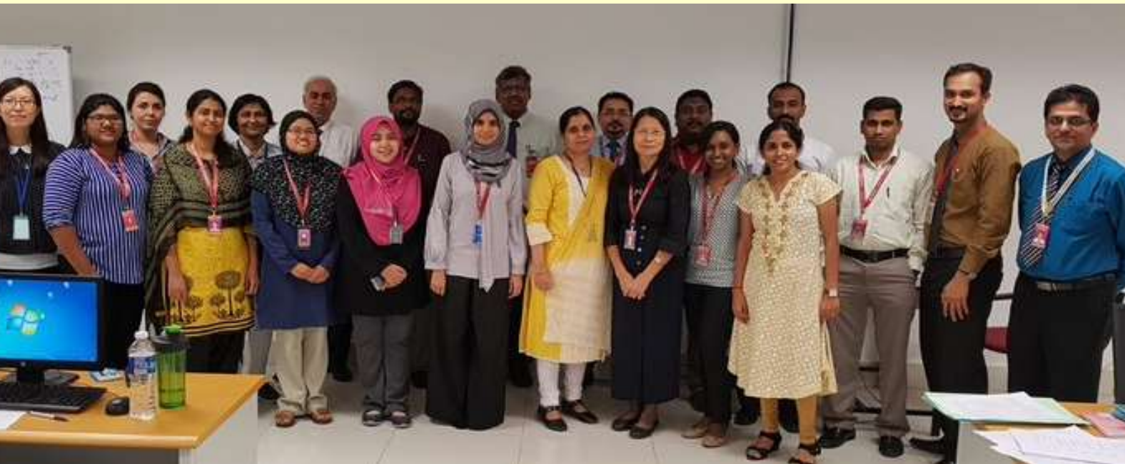
Participants of the SPSS basic course in Statistics